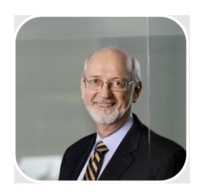
Age 79 Independent Trustee<sup>1</sup>: Since 2015 Toronto, Ontario, Canada